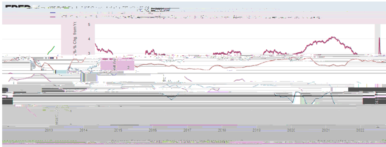
Graph 2: A-Rated Corporate Bond Effective Yield and Core CPI, Jan. 1, 2012 Feb. 9, 2022

Graph 3 shows similar data for BBB-rated corporate bonds. With BBB yields generally higher than A yields, the difference between the two measures has been negative for a shorter period of time. Real yields did not turn negative until May 2021, and they dipped to almost -1% in December 2021.